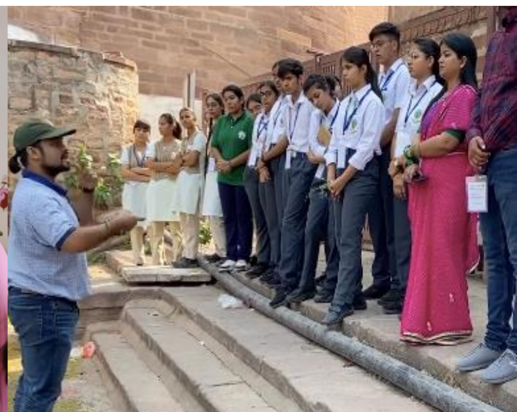
Schools getting ready for the future