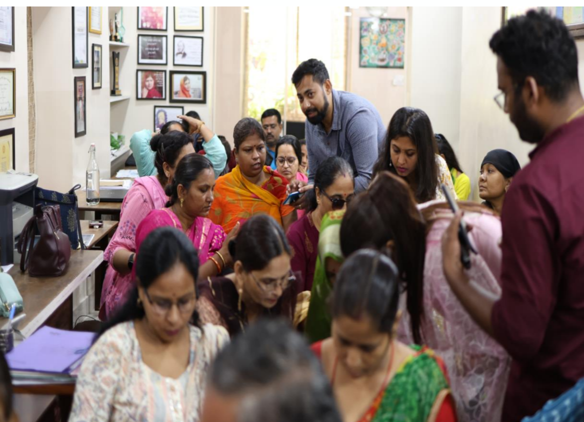
Mutual learning sessions - intergenerational dialogue, documentation of wisdom

Hyperlocal climate decisions by women, call for use of place-based wisdom by children etc.