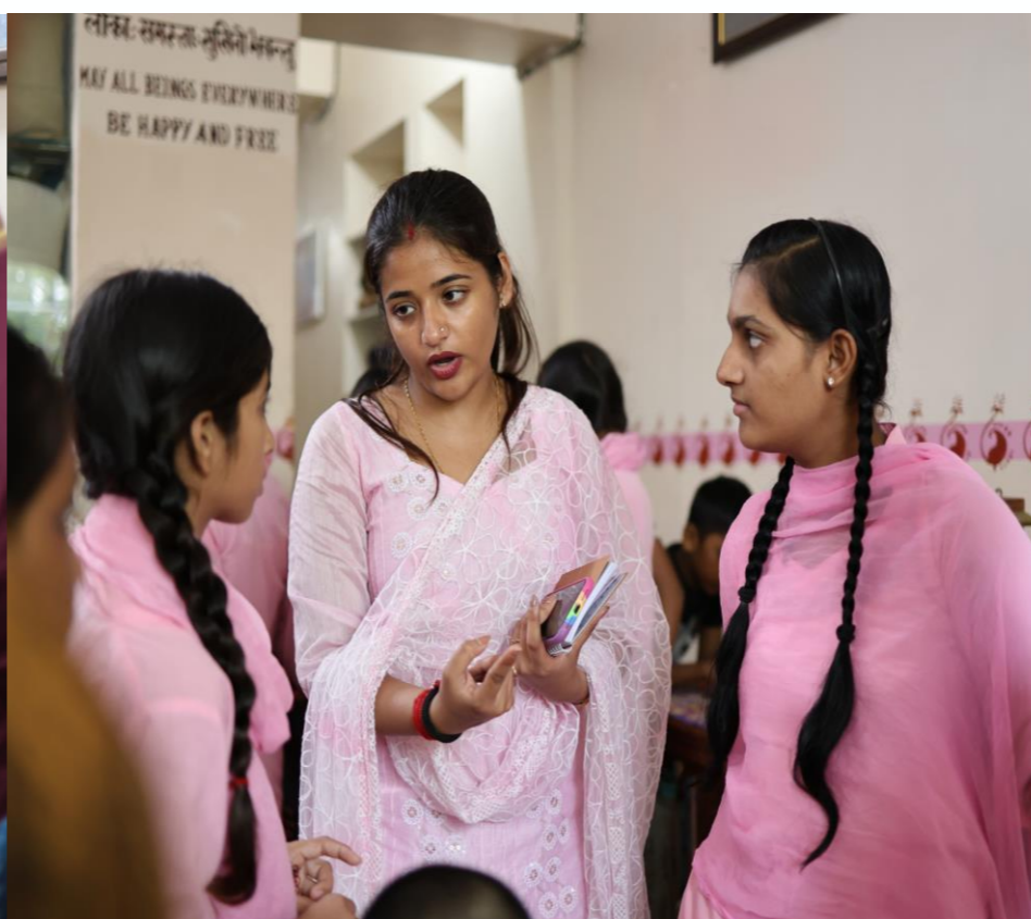
Young minds in action